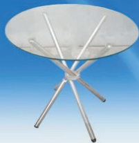
F13 - Round Glass Table F13 - Bàn kính tròn