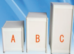
F12 - Display Cube F12 - Bục trưng bày