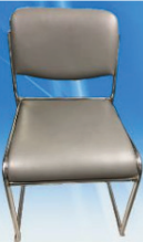
F8 - Cushion Chair F8 - Ghế chân quỳ