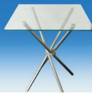
F15 - Square Glass Table F15 - Bàn kính vuông