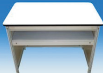
F2 - Information counter & shelf F2 - Bàn thông tin có ngăn