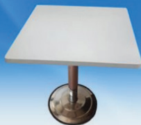
F16 - Square Wood Table F16 - Bàn gỗ vuông