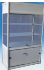
F20 - Tall Showcase F20 - Tủ kính lớn