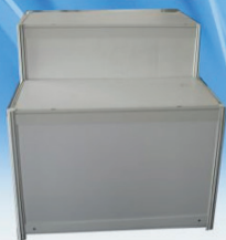
F28 - 2-tier counter F28 - Kệ 2 tầng lớn