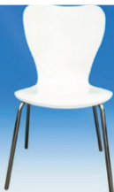
F7 - White Wooden Chair F7 - Ghế gỗ trắng