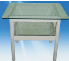
F17 - Square glass table + shelf F17 - Bàn kính vuông có kệ