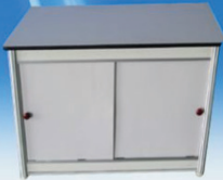
F5 - Lockable Cabinet F5 - Tủ có khóa