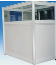
F18 - Low Showcase F18 - Tủ kính thấp