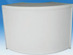
F4 - Curve information counter +shelf F4 - Quầy thông tin cong có ngăn