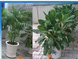
F31 - Potted Plant F31 - Cây kiến