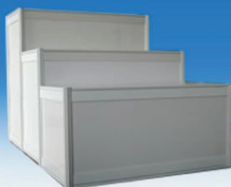
F26 - 3-tier counter F26 - Kệ 3 tầng lớn