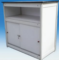
F6 - Lockable Cabinet & shelf F6 - Tủ cao có khóa