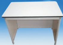
F1 - Information counter F1 - Bàn thông tin