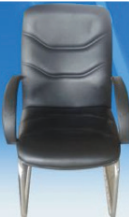
F11 - Black Leather Arm Chair F11 - Ghế V.I.P