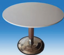
F14 - Round Wood Table F14 - Bàn gỗ tròn