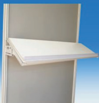
F22 - Slope Shelf F22 - Kệ trưng bày nghiêng