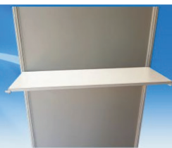
F21 - Flat Shelf F21 - Kệ trưng bày thẳng