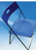
F9 - Folding Chair F9 - Ghế xếp inox