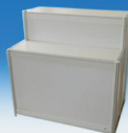
F27 - 2-tier counter F27 - Kệ 2 tầng nhỏ