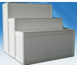
F25 - 3-tier counter F25 - Kệ 3 tầng nhỏ