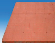
F33 - Platform (Fuvi) F33 - Pallet nhựa