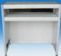
F3 - Tall information counter & shelf F3 - Bàn thông tin cao có ngăn